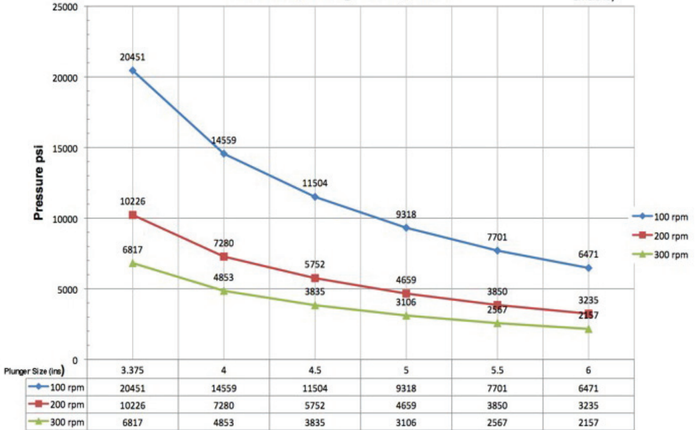
Pressure / Plunger Size / RPM